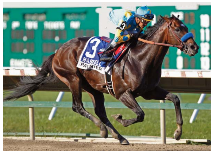
Paynter, Winning the Haskell

The sale of 24 yearlings by Paynter---for prices as high as $520,000---at the recent Keeneland September Sale was a pleasant reminder of a health crisis which four years ago went from foreboding to veterinary triumph.