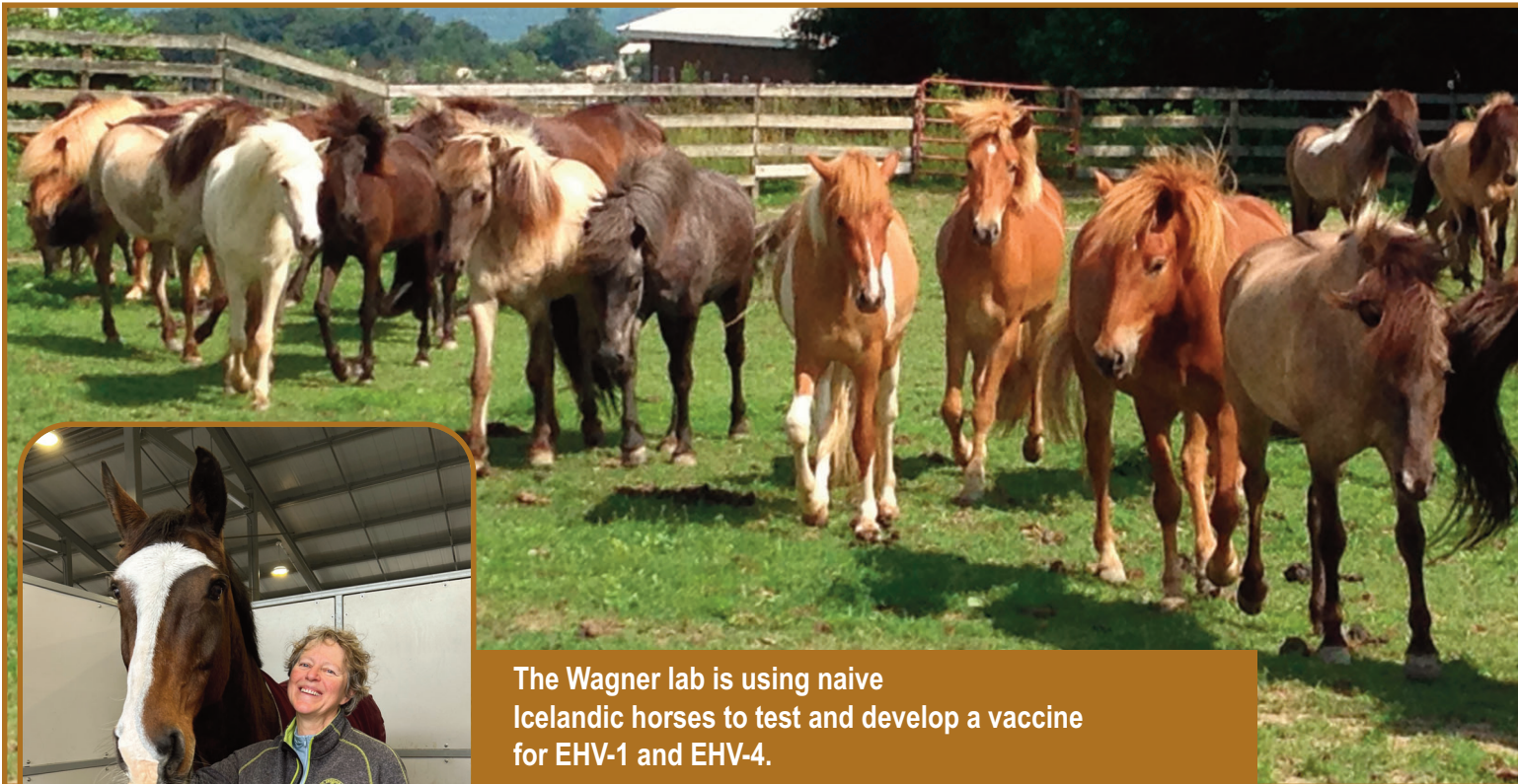
The Wagner lab is using naive Icelandic horses to test and develop a vaccine for EHV-1 and EHV-4.

During the first year the project, we identified the most promising viral target structures for DNA vaccine development. EHV-1 and EHV-4 carry several viral proteins on their outer membrane. These viral proteins are essential for the virus to bind to and enter equine host cells. However, due to their location at the outside of the virus, several of them also provoke high immune responses. To find the best viral targets for the EHV-1/4 DNA vaccine targets, we produced all viral proteins in the laboratory and then, used