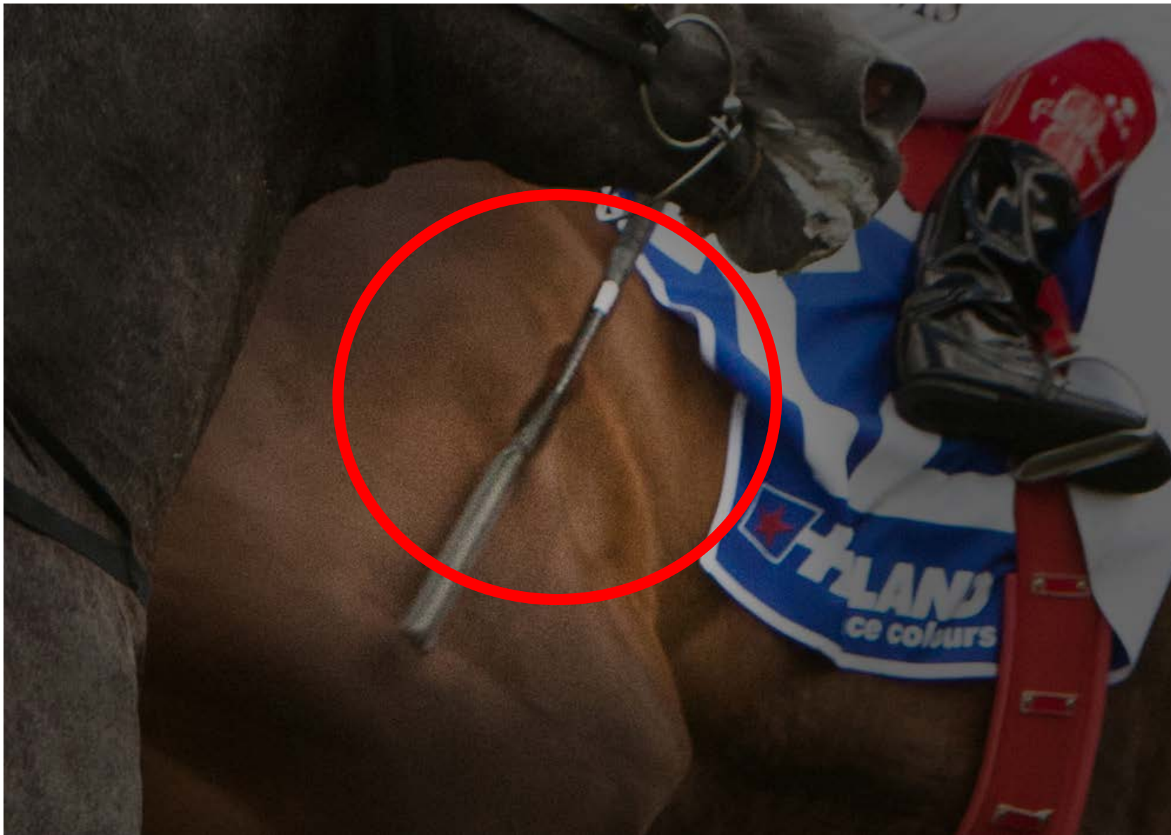
Shaft hitting not padded surface